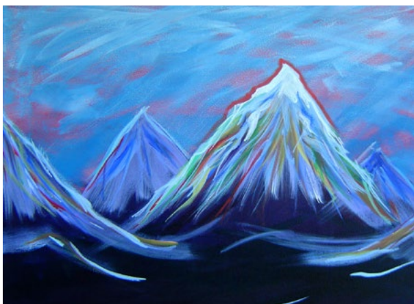
Mountain of God – 22” x 16” Acrylic on Canvas

Psalm 48:1-5- Great is the LORD and greatly to be praised in the city of our God! His holy mountain, beautiful in elevation, is the joy of all the earth, Mount Zion, in the far north, the city of the great King. Within her citadels God has shown himself a sure defense. For lo, the kings assembled, they came on together. As soon as they saw it, they were astounded, they were in panic, and they took to flight.