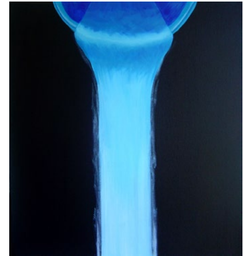
Eternal Waters – 20” x 22” – Acrylic on Canvas

Genesis 1:2- ...And the Spirit of God moved upon the face of the waters.